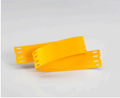
PPQ+19060 profile for printing in Partex MK10