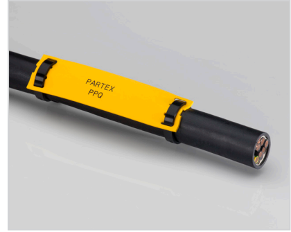
PPQ+19060 mounted on a cable.